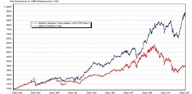
Performance 1985 to 2003 British Empire

[C] Fundamental Data (2004) www.funddata.com